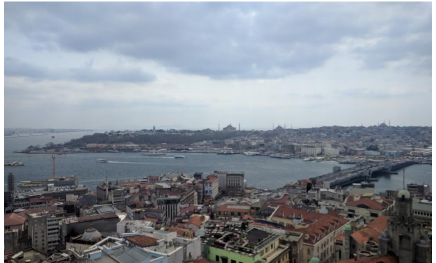
ASAS Aluminium A.S. | Sakarya, Turkey